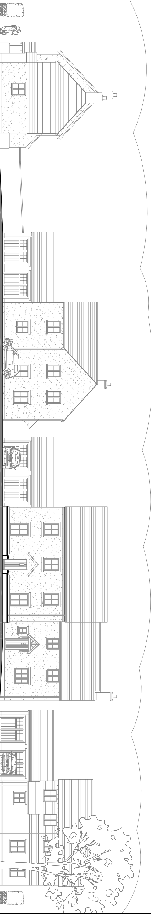
Plots 10-11 FFL. 201.85m